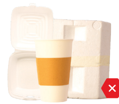
No Foam Cups & Containers