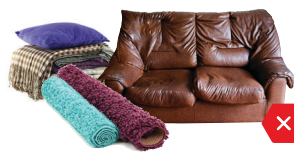
No Clothing, Furniture or Carpet