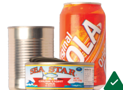
Food & Beverage Cans