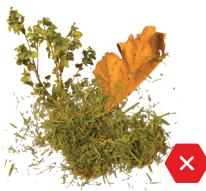
No Yard Waste