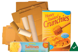
Flattened Cardboard & Paperboard