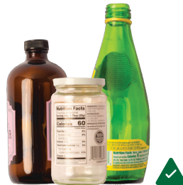
Glass Bottles & Containers