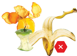
No Food or Liquids