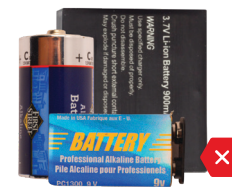
No Hazardous Waste or Batteries