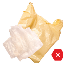
No Loose Plastic Bags, Recyclables in Plastic Bags, or Film Empty recyclables directly into your cart