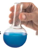
Table Information The tables contain chemical constituents which have been found in your drinking water. The TCEQ and the Environmental Protection Agency (EPA) require water systems to test up to 97 constituents. Only two regulated constituents were detected in Mills Road MUD's water, and these were well below the maximum contaminant level allowed in drinking water. The agencies do not require some contaminants to be monitored annually because their concentrations are not expected to vary. This report states the results of the most current water testing from 2005 through 2009.

En Español – Este reporte incluye informacion importante sobre el agua para tomar. Si tiene preguntas o discusiones sobre este reporte en espanol, favor de llamar al tel. 281.376.8802 par hablar con una persona bilingue en espanol.