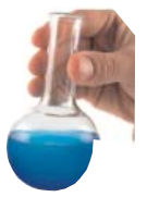
TABLE INFORMATION The tables contain chemical constituents which have been found in your drinking water. The TCEQ and the Environmental Protection Agency (EPA) require water systems to test up to 97 constituents. Only nine regulated constituents were detected in Forest Hills MUD's water, and these were well below the maximum contaminant level allowed in drinking water. The agencies do not require some contaminants to be monitored annually because their concentrations are not expected to vary. This report states the results of the most current water testing from 2005 through 2009.

En Español – Este reporte incluye informacion importante sobre el agua para tomar. Si tiene preguntas o discusiones sobre este reporte en espanol, favor de llamar al tel. 281.376.8802 par hablar con una persona bilingue en espanol.