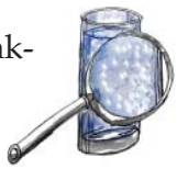
TABLE INFORMATION The tables contain chemical constituents which have been found in your drinking water. The TCEQ and the Environmental Protection Agency (EPA) require water systems to test up to 97 constituents. Only six regulated constituents were detected in MUD 44's water, and these were well below the maximum contaminant level allowed in drinking water. The agencies do not require some contaminants to be monitored annually because their concentrations are not expected to vary. This report states the results of the most current water testing from 2005 through 2009.

En Español – Este reporte incluye informacion importante sobre el agua para tomar. Si tiene preguntas o discusiones sobre este reporte en espanol, favor de llamar al tel. 281.376.8802 par hablar con una persona bilingue en espanol.